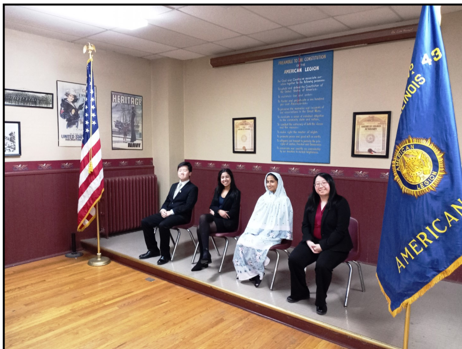
Post 43 High School Oratorical Contestants January 7, 2023

American Legion Post #43 PO Box 4, Naperville, IL 60566