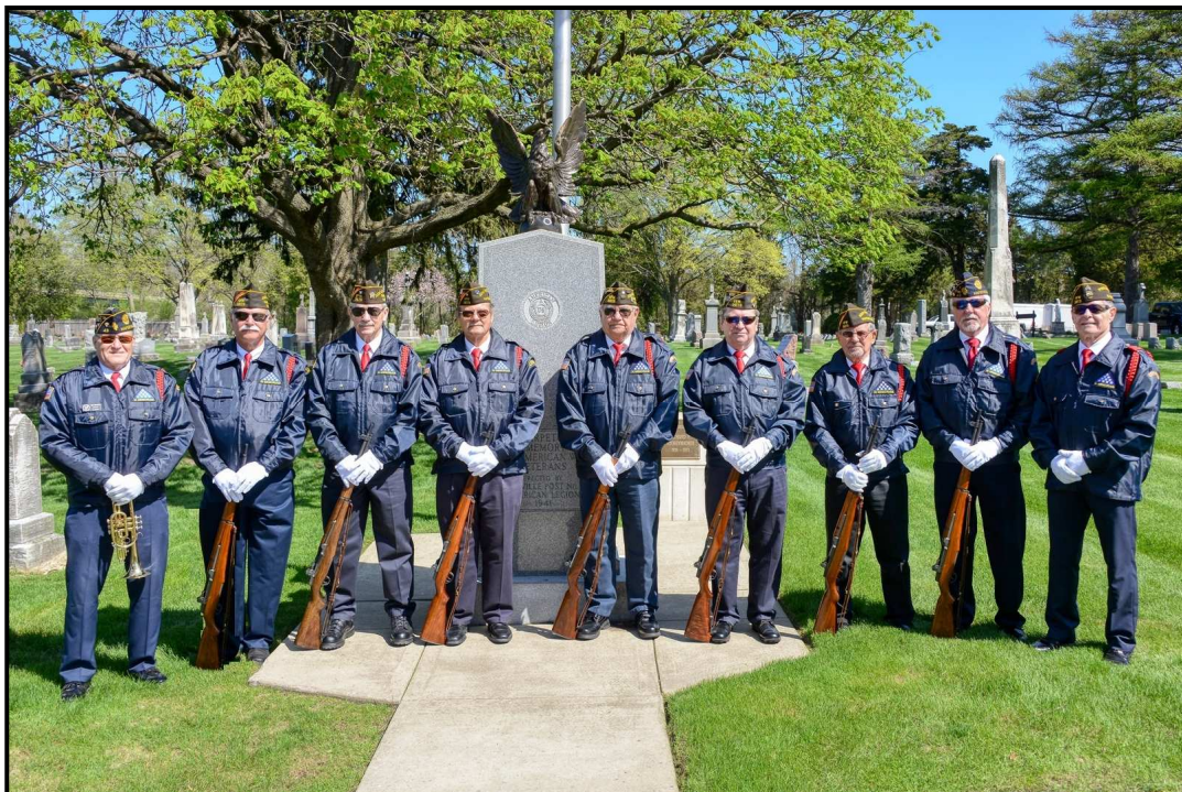
Combined Post 43 and Post 3873 Honor Guard performs Military Honors for Veterans final Salute.