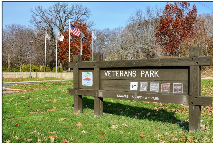
Naperville Veterans Park

Another milestone in Post 43's history came in 1947 with the purchase of a Post Home as a permanent meeting place for members. Members of Post 43 funded the purchase of a building owned by the Naperville Oddfellows Temple Association by buying varying numbers of bonds, each with a face value of $100. Currently, portions of the Post Home building at 10 W. Chicago Av. in Naperville are rented to commercial interests with the top floor retained by Post 43 for meetings of Post Trustees, certain Post activities; and is used by affiliated groups, such as Boy Scout Troop 106. Current monthly Post meetings are now held at the Judd Kendall VFW Post 3873.