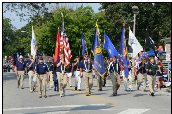
Memorial Day Parade held in Naperville

Post 43's close relationship with the community continued through the years. An example of these close ties between the Post and the city of Naperville occurred in 1933.