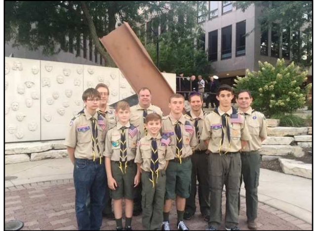
Boy Scout Troop 106

In addition to special campaigns, Post 43 supports an array of ongoing programs in support of veterans, young people and the community. These programs include: Boy Scout Troop 106; Premier Boys State; Illini Girls State; High School Oratorical and Middle School Speech contests; College Scholarships; and annual recognition of Citizen of the Year Awards to members of the local leaders for contributions to Veterans, Youth and the Community.