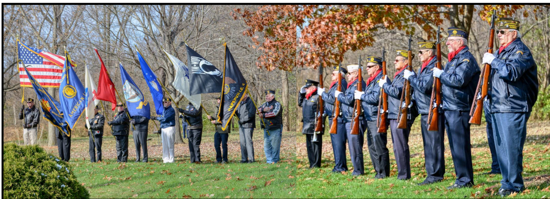
Naperville Veterans Day

Post 43 currently has over 540 members. The Post continues to participate in Veterans Day observances, including visits by Veterans to local schools and the ceremony at Naperville's Veterans Park.